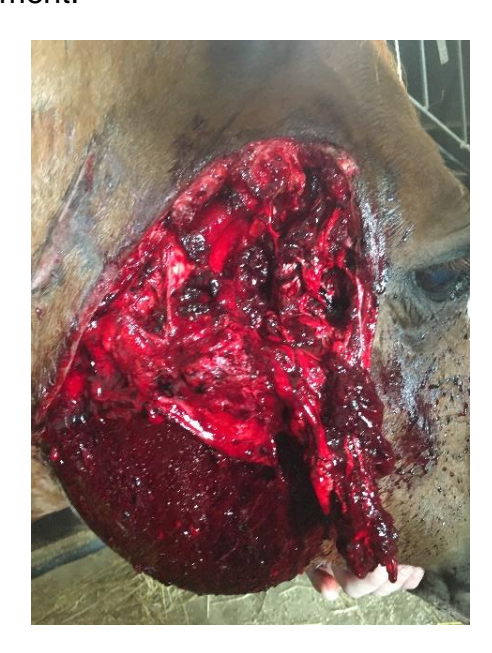
Initial exam at the farm

Last fall we took an emergency call for a 15 year old quarter horse mare with a laceration on her face. Upon arrival at the farm she had a large triangular laceration on the right side of her face. It was a large flap of skin with muscle and other soft tissue hanging down leaving the mandible (jaw bone) and several major blood vessels and nerves exposed. She also had a long superficial laceration (only skin deep) on the left side of her face. A physical exam showed the mare was in shock which was not surprising as several large areas of blood loss were seen in her paddock. Although she was not actively bleeding on arrival, when she would lower her head she would begin dramatically bleeding from major blood vessels in the throatlatch area. A pressure bandage was placed over the wound and she was transported to the Nebraska Equine Veterinary Clinic for more intensive treatment.