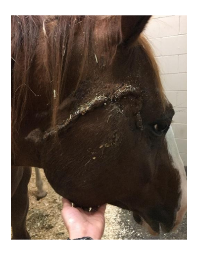
Left: Close up of wound immediately after repair with penrose drain. Middle: Shows wound repaired and lack of muscle tone in lips from facial nerve paralysis (droopy lips). Right: 3 days post-repair after removing the penrose drain.

The mare was hospitalized for several days for treatment and monitoring. The alignment of her teeth was skewed due to the damage to the skull affecting the temporomandibular joint ("TMJ" or jaw joint), and the muscles of the jaw. Along with that, she had facial nerve paralysis on both sides of her face causing her lips to be paralyzed. A horse's lips are very important for grabbing food as well as drinking water. There was a major concern the first few days as to whether she would be able to eat, as she was struggling to move her jaw and could not eat hay. Although her appetite was great, the senior mash she was offered ended up mostly on the ground. After several days of treatment with anti-inflammatories and antibiotics some of the swelling went down and she was able successfully eat her senior feed and had started eating hay. At that point she was released to go home.