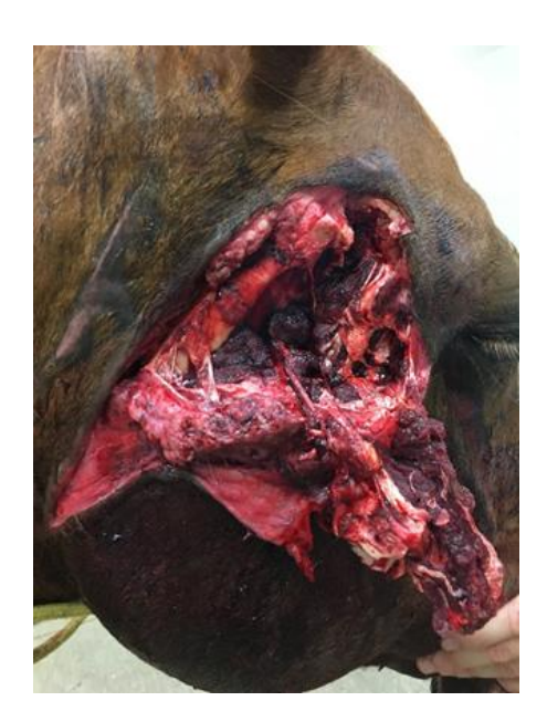
Wound after cleaning at the clinic

At the clinic, the bandage was removed and the mare was prepared for the wound to be repaired. To complicate the repair, the wound started bleeding rapidly again. The blood vessels were then tied off to stop the bleeding and she was treated with IV fluids for shock. The flap was closed with a combination of sutures and staples. The tan rubber material sticking out of the wound is a drain, which allows for any fluid build-up within the wound to drain out instead of building up underneath the suture line, and causing the wound to dehisce (or break open). The drain was removed when drainage was no longer noted, approximately three days after the repair.