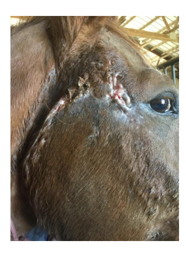
3 weeks post injury after suture removal