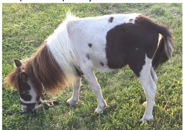
*Patient's name has been changed for the sake of this article.

Meet the patient: "Spot" 1 year old miniature horse colt