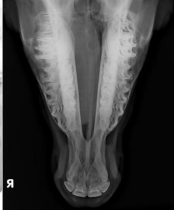
Image: the radiograph on the left is a side view of the skull. The radiograph on the right is a view from the font of the skull showing the same mass.